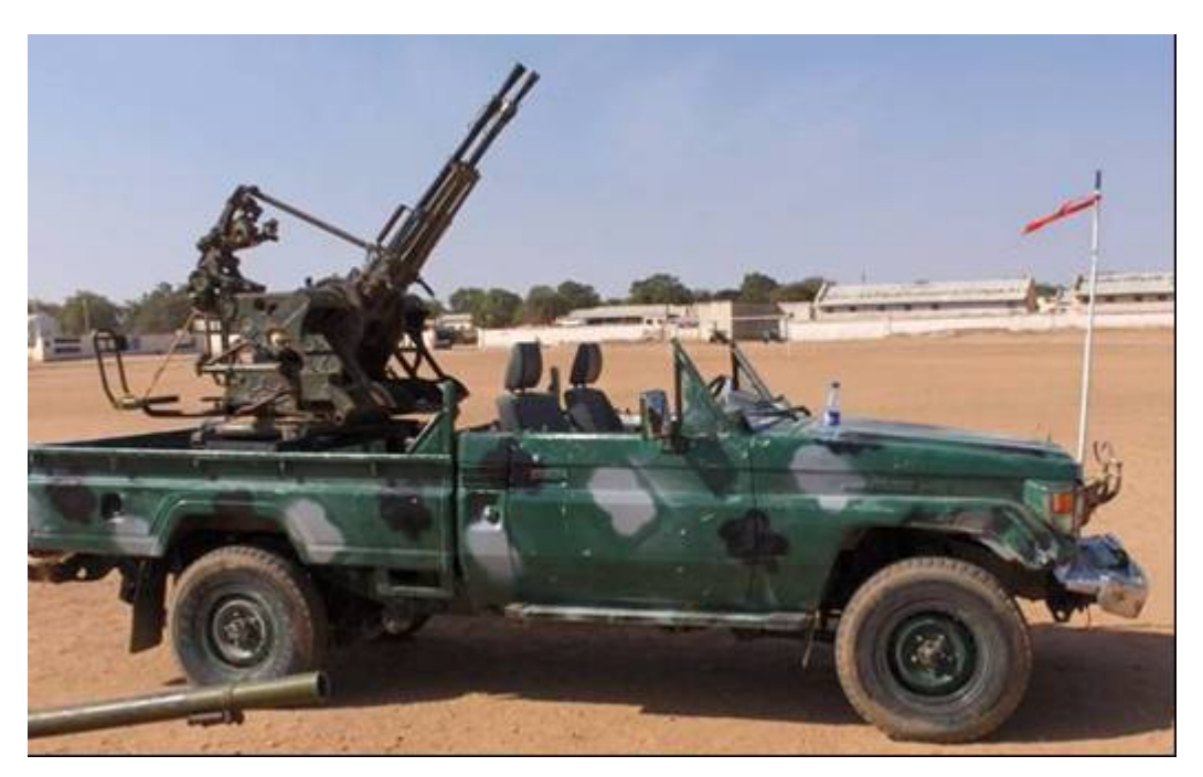
Figure 1 Twin-barrel 14.5-mm machine gun (on Government of the Sudan vehicle for display only)