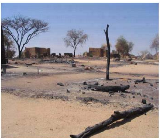
Figure 16 Burned houses in Abu Sikin village

114. The Panel held discussions with some of the villagers and the local Commander of Sudan Liberation Army (SLA) (Free Will), who narrated the events of the past months. According to information available with the Panel, Abu Sikin