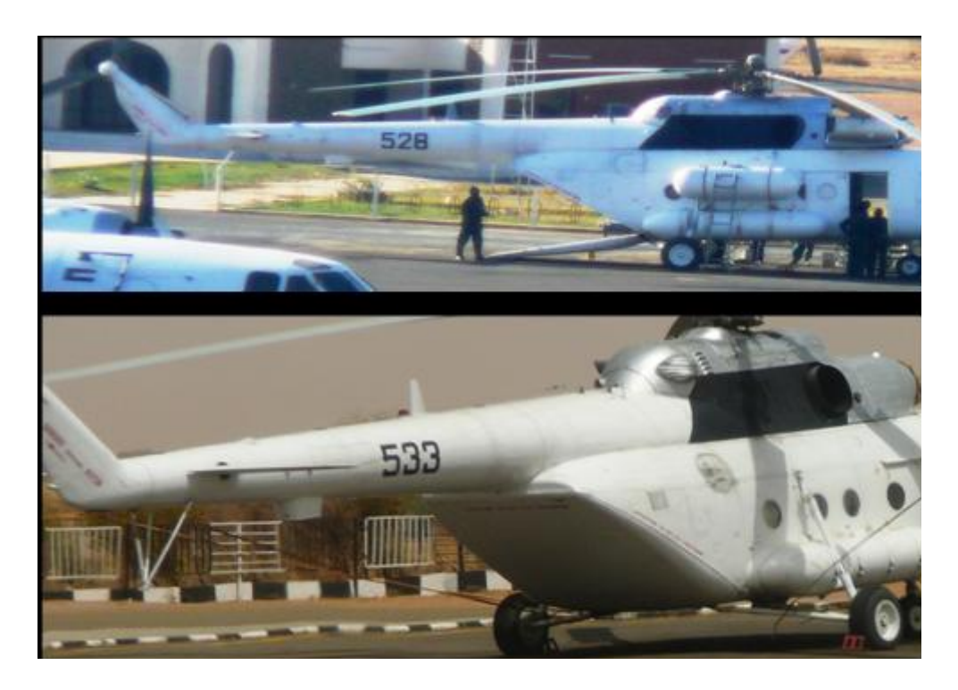
Figure 11 Two white helicopters used by the armed forces of the Government of the Sudan in Darfur: Mi-171 No. 528 at El Fasher Airport, 26 February 2007; and Mi-171 No. 533 at Nyala Airport, 26 February 2007

95. The Panel believes that the use of white aircraft by the Government of the Sudan constitutes a deliberate attempt to conceal the identity of these aircraft such that from a moderate distance they resemble United Nations or AMIS Mi-8 helicopters used in Darfur. The Panel has received reports from two independent sources of military reconnaissance overflights by white Antonov aircraft and white helicopters, believed to be those operated by the Government of the Sudan, in the area of Jebel Moon, Western Darfur.