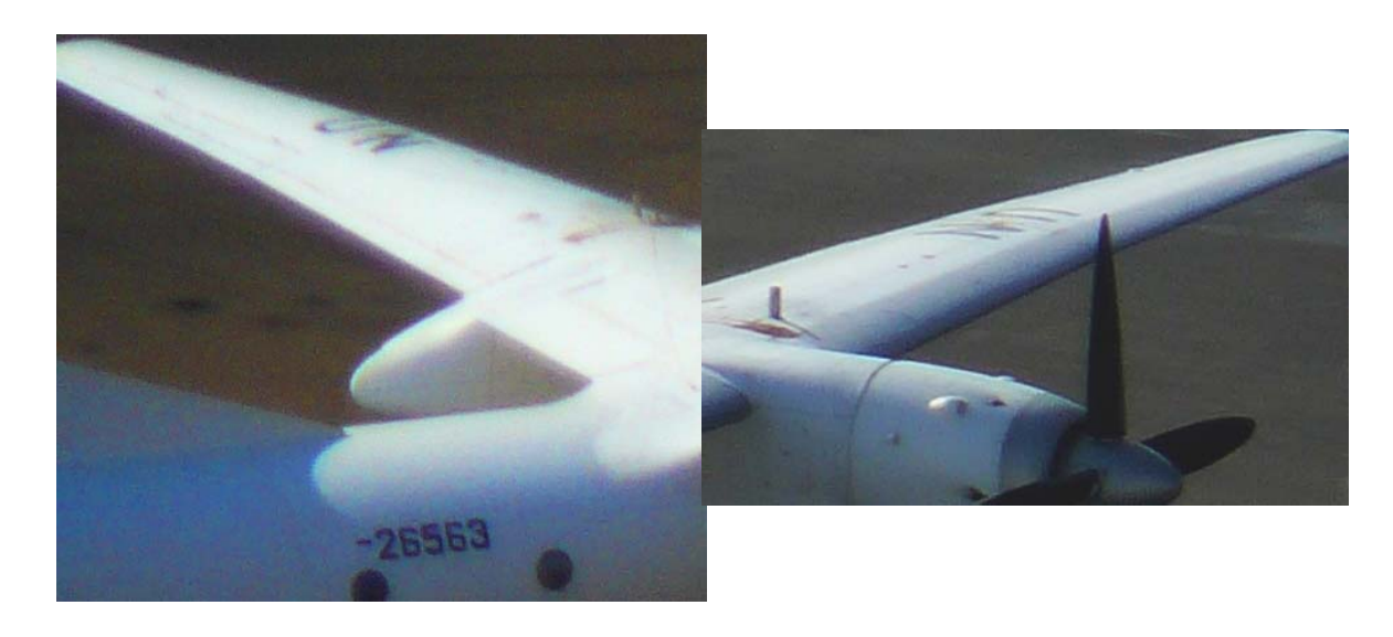
Figure 15 AN-26 aircraft ST-ZZZ at El Fasher Airport, 15 January 2007

97. The Panel observed another white Government of the Sudan AN-26 aircraft operating in the Darfur states. That aircraft has a Sudanese civil aviation registration painted on the fuselage, ST-ZZZ (see figure 15), but SAF is painted below the cockpit.