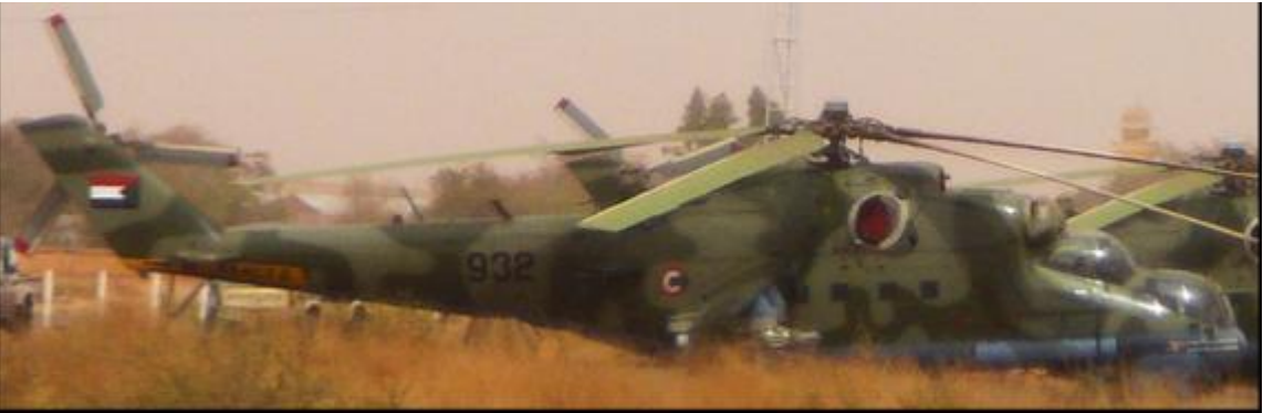
Figure 7 Two images of Government of the Sudan helicopter Mi-24 No. 932. Top: at Khartoum International Airport military apron, 28 January 2007. Bottom: at El Fasher Airport, 26 February 2007