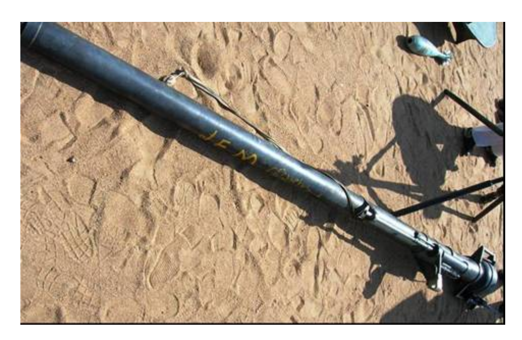
Figure 3 106-mm recoilless rifle with JEM markings