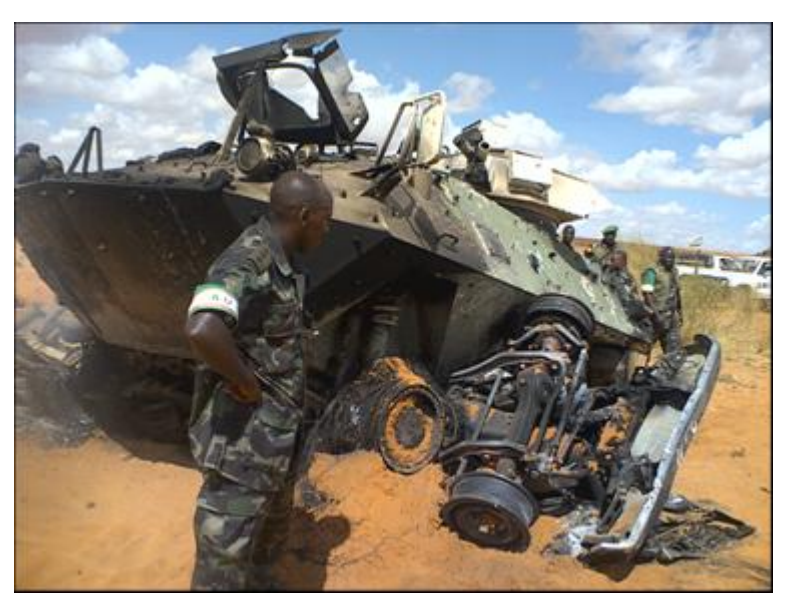
Figure 9 Destroyed AMIS armoured personnel carrier following attack on AMIS escort, 19 August 2006

81. According to information available with the Panel, Matthew Petroleum Company, a company incorporated in the Sudan in 2001, supplies Jet A1 fuel to AMIS and, under the terms and conditions of the contract between them, AMIS provides escort to the tankers. On 19 August, a convoy of 27 fuel tankers left Kuma for El Fasher and, at a place 60 km from El Fasher, was attacked by a group of armed men in approximately 46 pick-up trucks, mounted with 12.7-mm, 14.5-mm and 23-mm machine guns and 106-mm recoilless rifles and mortars. Two AMIS soldiers were killed. Twenty of the 27 tankers were reportedly on the escort list of Matthew Petroleum Company; 7 of those listed and 2 unlisted were rescued, taking the total count of the missing tankers to 18.