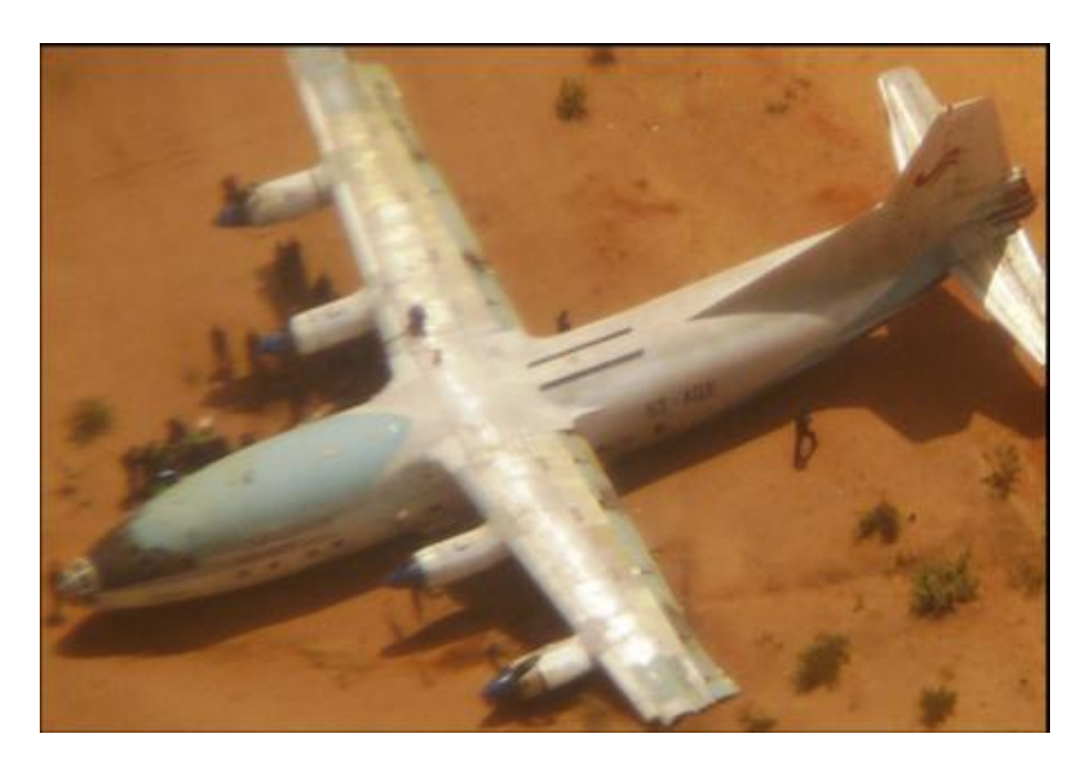
Figure 5 AN-12 (ST-AQE) aircraft at El Geneina Airport, 28 February 2007