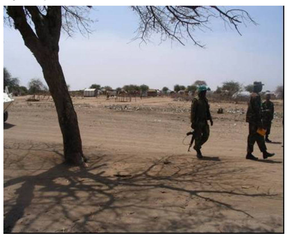
Figure 10 Site of attack/ambush against AMIS personnel