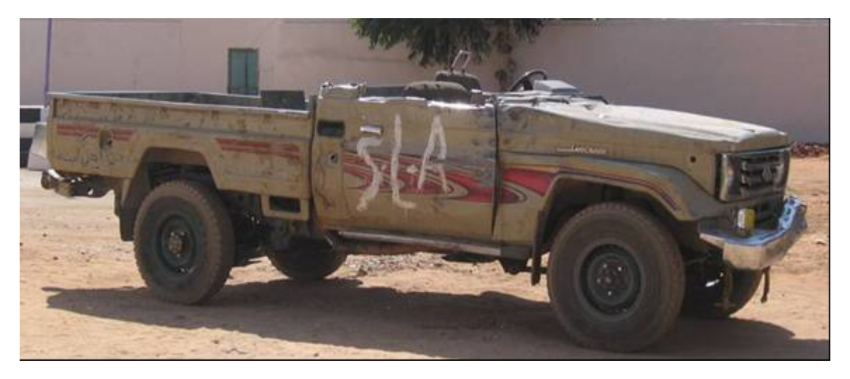
Figure 4 SLA vehicle