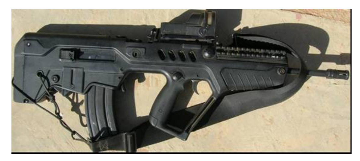
Figure 2 Tavor-21 5.56-mm assault rifle