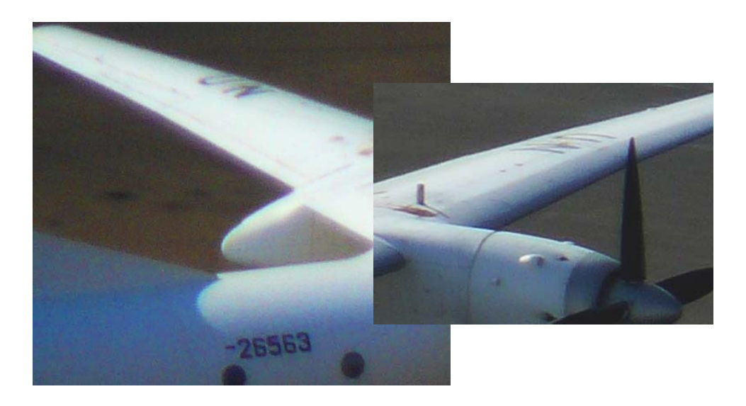
Figure 14 AN-26 aircraft No. 7705 with United Nations markings (port wing) at El Fasher Airport, 7 March 2007

97. The Panel observed another white Government of the Sudan AN-26 aircraft operating in the Darfur states. That aircraft has a Sudanese civil aviation registration painted on the fuselage, ST-ZZZ (see figure 15), but SAF is painted below the cockpit.