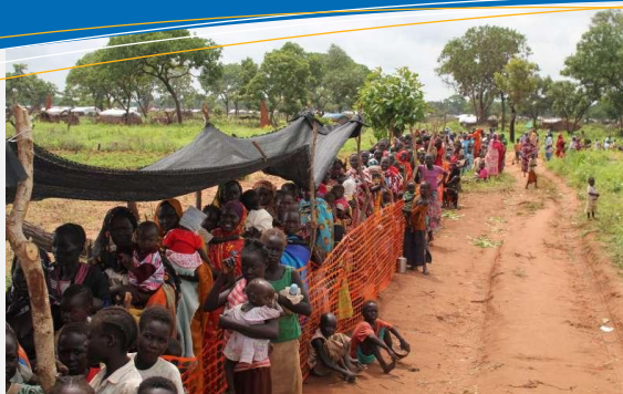
Sudanese women and children wait for treatment for malnutrition at Yida refugee camp in Unity State.