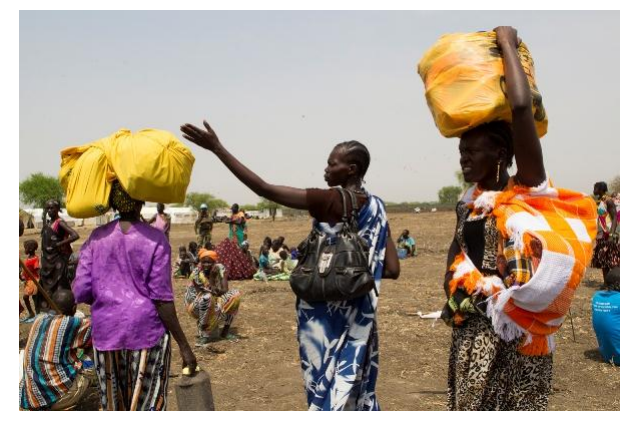
Women, children and the elderly are the most affected by insecurity in Pibor, Jonglei State.

An unconfirmed number of civilians in Pibor town have sought refuge in the bush along the Keng Keng River while others temporarily sought safety in UN mission compound. Places such as Kondako and Longachot remain largely deserted, with people reportedly only