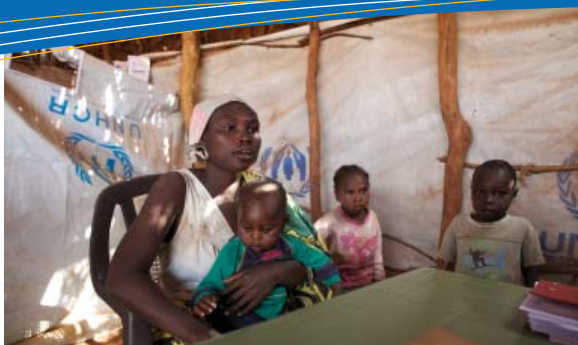
A woman in Yida settlement talks with UNHCR staff.