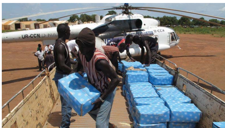
Logistics partners unload food in Yida settlement (WFP).

Food partners are making good headway in meeting their targets for pre-positioning relief supplies before the rainy season begins. The World Food Programme (WFP) aims to pre-position nearly 95,000 metric tons of food in seven states, and has currently reached 64 per cent of that target. Pre-positioning is nearly complete in Lakes, Warrap and Western Bahr el Ghazal states, while in Northern Bahr el Ghazal and Unity the rate is lower, at 54 and 34 per cent respectively.