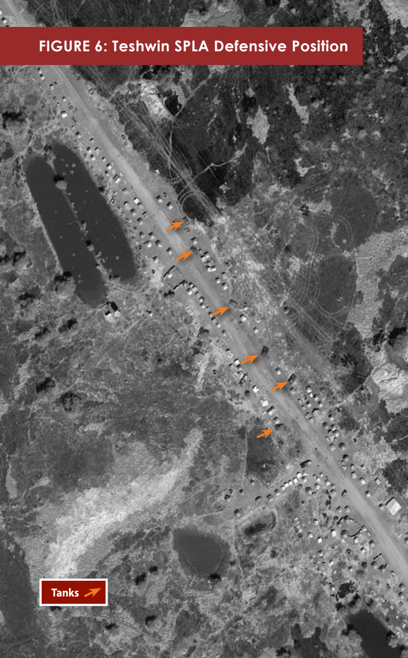
Teshwin, Unity State, South Sudan January 9, 2013