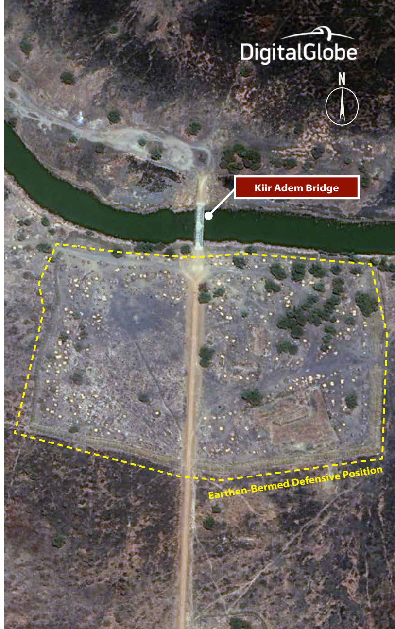
Kiir Adem, South Sudan April 11, 2013

South Sudan has maintained a defensive position in Kiir Adem, a small village near a bridge crossing the Bahr al-Arab, or Kiir River, since at least November 2011. (see figure 7) The river currently serves as the border between the two Sudans and lies at the center of the contested 14 Mile Area. 22 Other than a small reduction in the number of tents within the earthen-bermed protected SPLA position right at the bridge, no changes were observed between imagery from May 2012 and April 2013. Although no armored vehicles, artillery or other crew-served weapons were observed in either imagery, the defensive installation remained unchanged within the buffer zone.