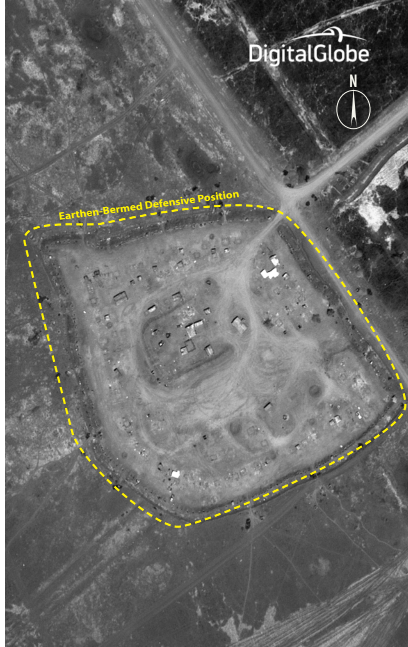
19 km south of Heglig, South Kordofan, Sudan April 4, 2013

Before and after imagery of two of SAF's defensive positions in Heglig shows that six main battle tanks—three from each defensive position—were removed from the area between February 12, 2013, and April 4, 2013. (see figures 2 and 3) The removal of these tanks evidences steps towards compliance with the March implementation modalities.