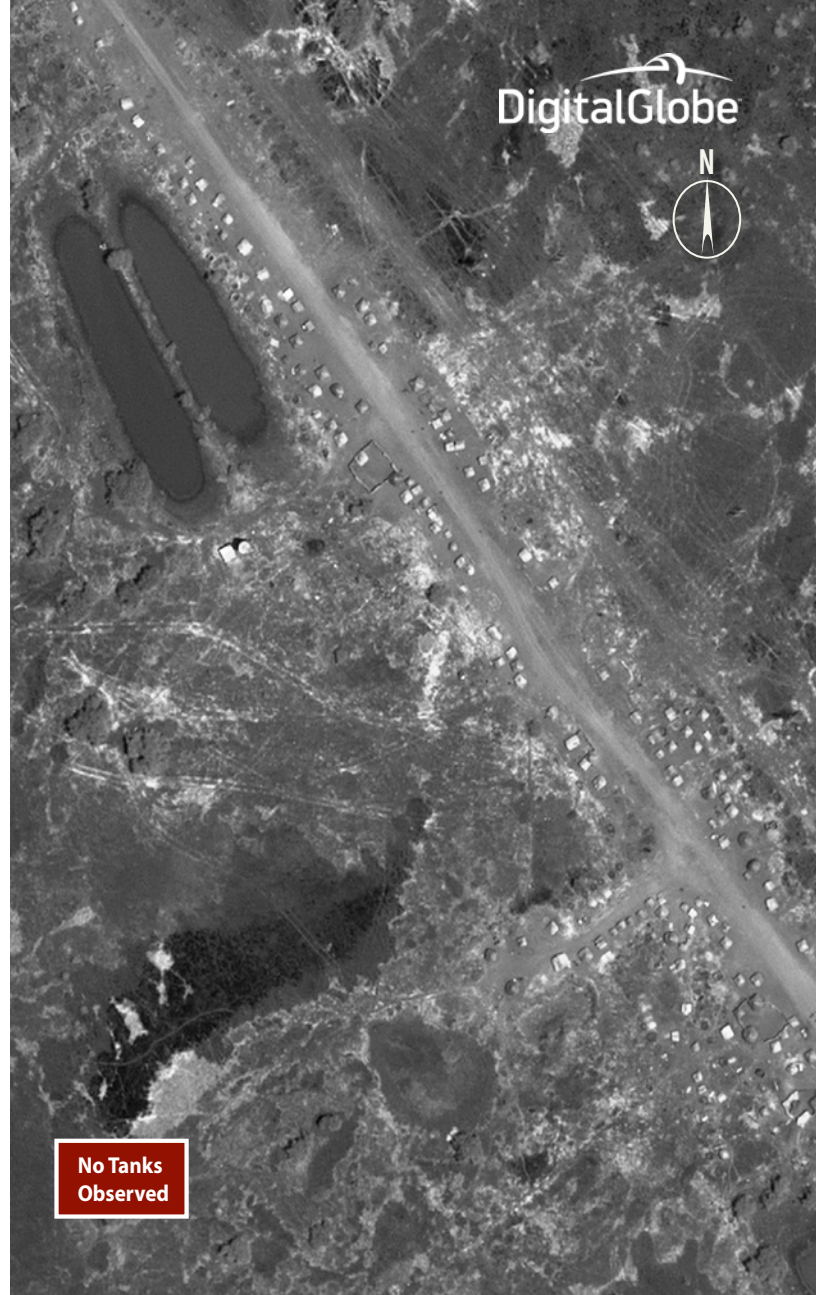
Teshwin, Unity State, South Sudan April 4, 2013

Before and after imagery of Tishwin, an SPLA defensive position, south of the border in the Heglig area shows that six tanks were removed from the area between January 9, 2013, and April 4, 2013. (see figure 6) The removal of these tanks provides documented evidence of South Sudan's steps toward compliance with the March 2013 implementation modalities for the security arrangements. The area is located about 2.5 miles (4 kilometers) south of the border in Unity State, South Sudan, and is part of the SDBZ. Some tents and temporary structures were observed on either side of the highway at this location, but DigitalGlobe analysts cannot determine via satellite if the remaining structures are military or civilian installations. (see figure 6)