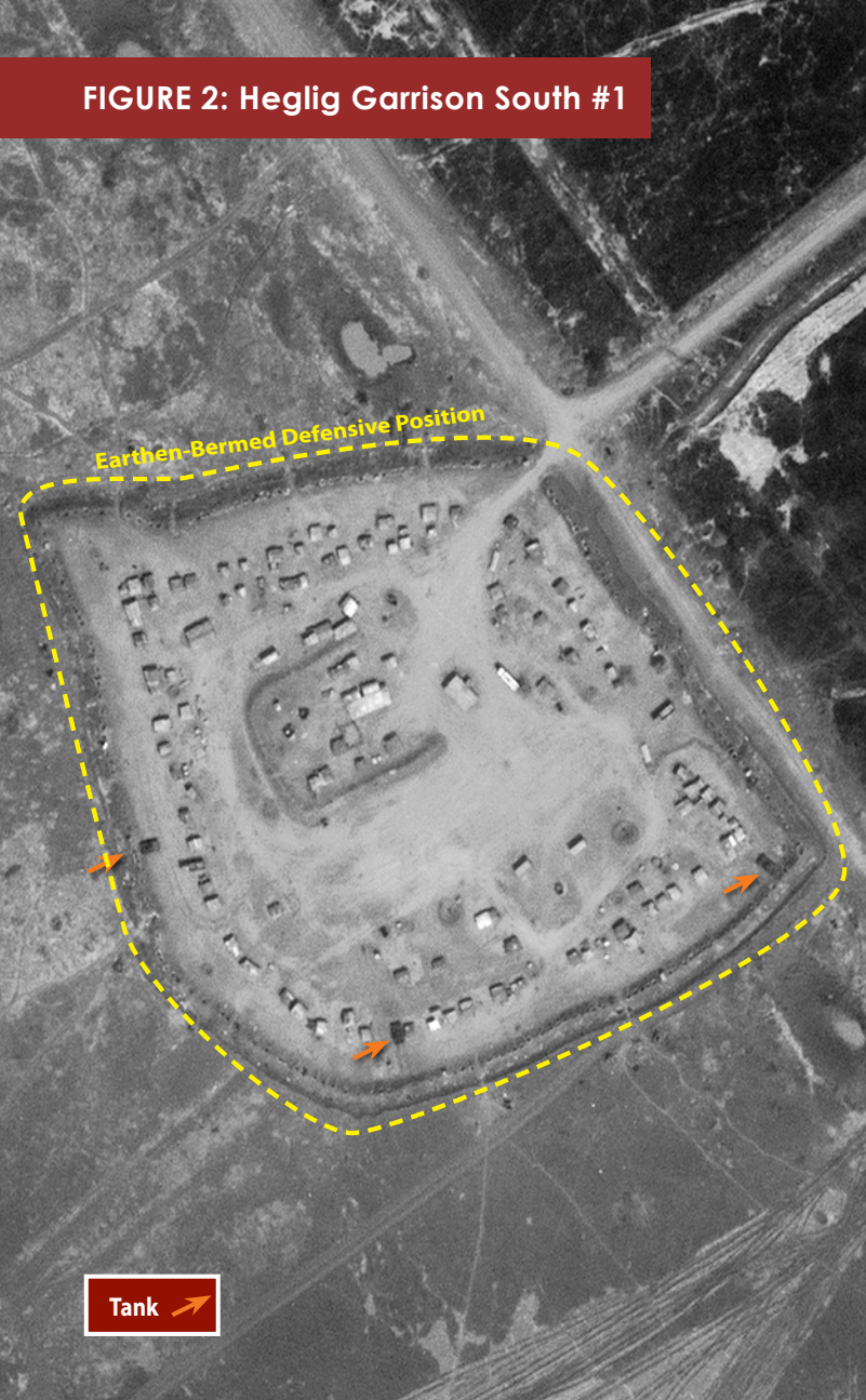
19 km south of Heglig, South Kordofan, Sudan March 5, 2013