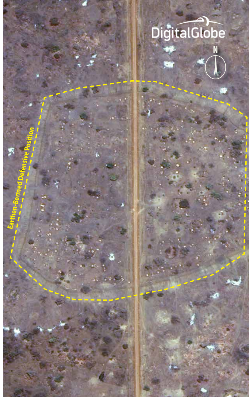
Kiir Adem, South Sudan April 11, 2013

Continued presence of armed SPLA troops at this location would be a violation of the Government of South Sudan's obligations under the March 2013 implementation modalities of the security arrangements. 23 Additionally, a newly expanded defensive position was observed in the April 11, 2013 imagery, 2.8 miles (4.5 kilometers) south of the bridge. (see figure 8) DigitalGlobe analysts consider this location to be another South Sudanese infantry unit without crew-served weapons. This position was not observed on imagery taken in October 2012. Establishing a new defensive position within the SDBZ would be a violation of the terms of the security arrangements. 24