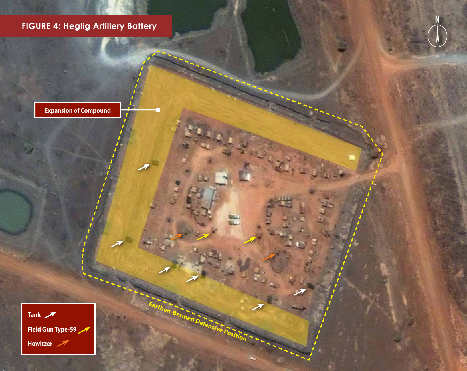
FIGURE 4: Heglig Artillery Battery

April 14, 2013, imagery (see figure 4) of the SAF Heglig Artillery Battery, located 6.5 miles (10.5 kilometers) from the border and approximately one-third of a mile (half of a kilometer) outside the SDBZ exclusion zone, supports DigitalGlobe analysts' conclusion that the tanks were probably relocated there after being moved from their defensive positions within the SDBZ. According to DigitalGlobe's approximation of the buffer zone, this shift moved the tanks to just outside the SDBZ.