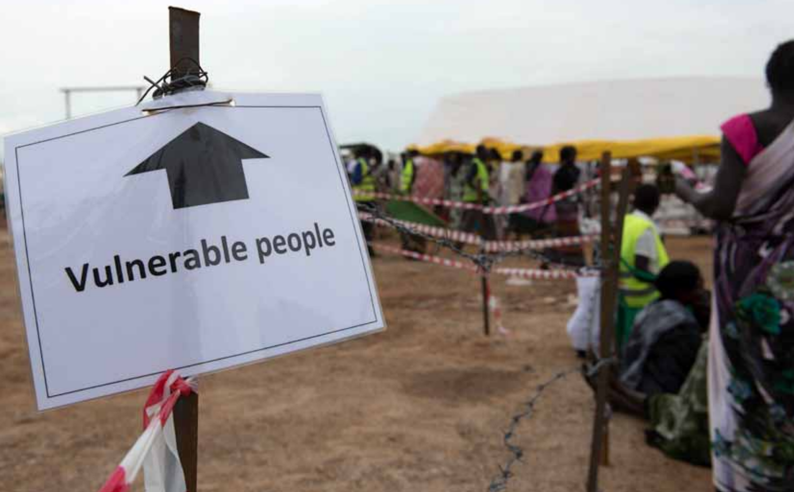
SUDAN, Topping: A sign reading “vulnerable people” is seen as women wait in line for food distribution at the UNMISS POC (United Nations Mission in the Republic of South Sudan for the Protection of Civilians) site on June 26, 2014 in Topping, South Sudan.

of civil society organisations, guaranteeing HRD’s rights to “promote and strive for the protection and realisation of human rights and fundamental freedoms”, protect them “against any violence, threats, retaliation, [...] discrimination, pressure or any other arbitrary action” 13 and engage into a constructive dialogue with these actors is also fundamental to the building of a democratic society.