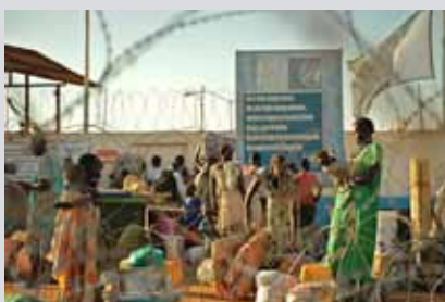
South Sudan, Juba: Residents of Juba arrive at the UN compound on December 20, 2013 where they sought shelter.